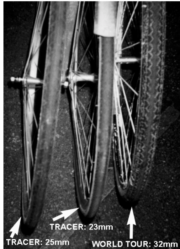
The three pneumatic tyres used in this experiment were all made by Michelin. The World Tour has a chunky tread whereas the Tracers have a thinner smooth rubber wall with a tread of thin cuts which are not visible in this slightly defocused photo.

I have used the multiplying factor of 1000 to give a value that can be expressed in the units of m/km which is easy to compare directly with the SCPF, 1 m/km. A positive value of F means that, if one were to use the smooth surface to calibrate and then layout a race course on the rough surface, the course would be laid out short by the factor F . Referring to the values of F in the table below, it can be seen that this would be the case for a solid tyre. Of the three pneumatic tyres the narrow tyres are the worst, with a danger of a short course if the calibration surface is rough and the race surface is smooth.